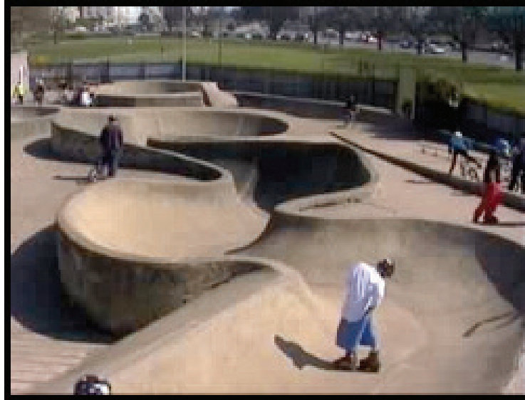
An example of Southsea Skate Park's Snake run